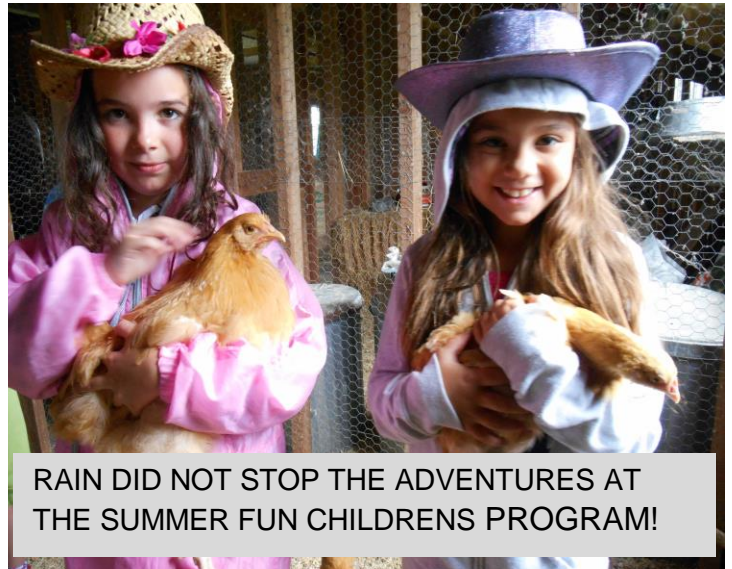
RAIN DID NOT STOP THE ADVENTURES AT THE SUMMER FUN CHILDRENS PROGRAM!

WOOD BEAD CAR SEAT COVER WET WIPES SQUARE (METAL) DOG BRUSHES TISSUES